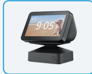
Echo Show 5 with Battery Back-up