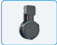
Bathroom Wall Mount